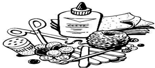
Table Favor Committee will meet on Tuesday February 12, 2019 at 1:30 pm We will be working on Valentines and Shamrock favors for Seneca House and Friedman Village.